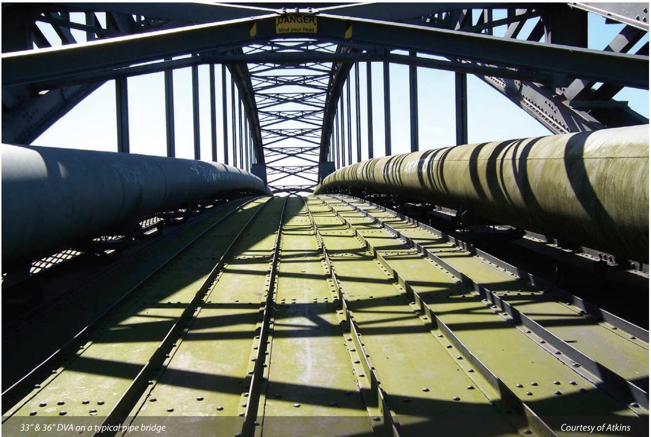
33" & 36" DVA on a typical pipe bridge

The Derwent Valley aqueduct (DVA) is a spectacular piece of Victorian/Edwardian engineering, and is one of Severn Trent Water's (STW) most important assets, forming part of its strategic water grid. Treated water flows by gravity alone, and the aqueduct conveys 200MI/d of drinking water from Bamford Water Treatment Works (WTW) in North Derbyshire to Hallgates Service Reservoir near Leicester, serving more than 590,000 customers in Nottinghamshire, Derbyshire and Leicestershire. The aqueduct consists of 180km of large diameter pipeline (cast iron and steel pipes), 16km in 6 (No.) sections of single 6' 3" diameter tunnel. It includes 1,000 (No.) valves, 14 (No.) bridges and culverts, and 307 (No.) other structures and chambers.