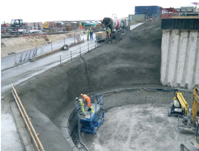
Photo shows contiguous piled wall, bulk excavation (supported by SCL) and headworks for pumping station shaft at Portobello

The 9.13 kilometres of segmentally lined transfer tunnel on the project will be driven using Lovat tunnel boring machines (TBMs). The TBMs will be launched from shafts at Peacehaven and at