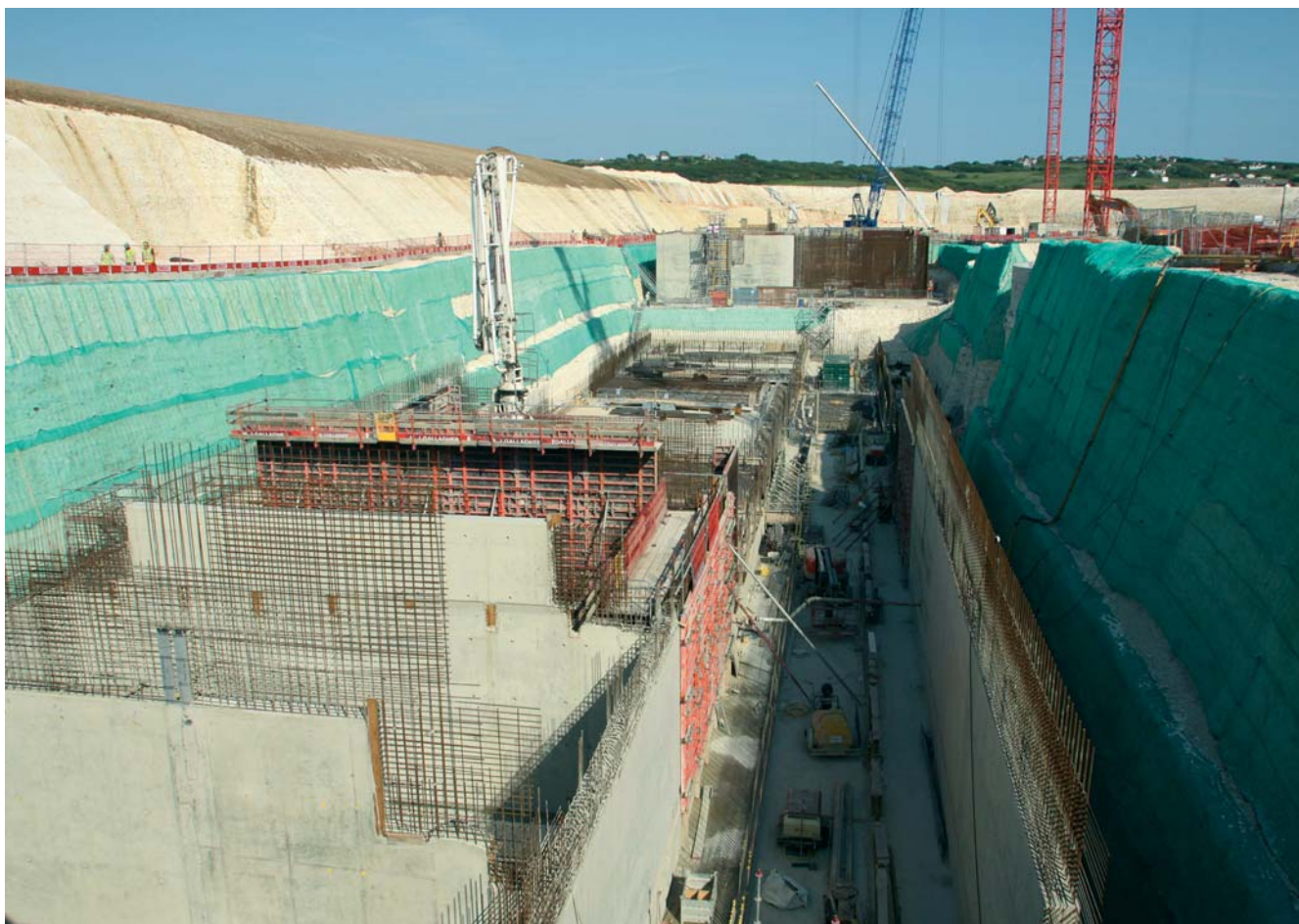
Reinforced concrete works for the BAFF, Lamella & SRC at Peacehaven WTW