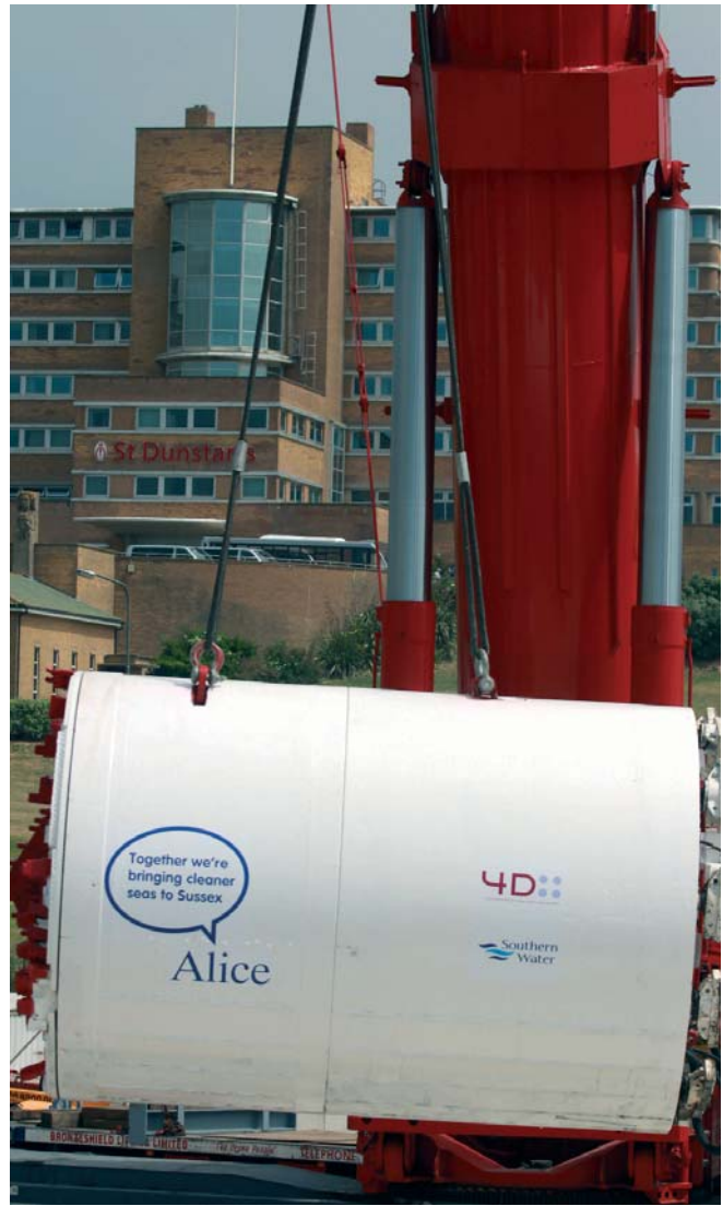
The first of two TBMs being launched at Ovingdean