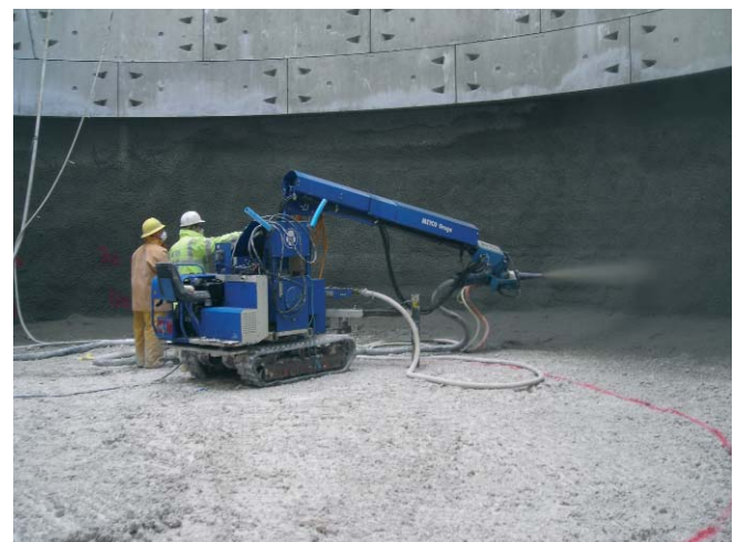
Remote control application of SCL at Marine Drive Pumping Station