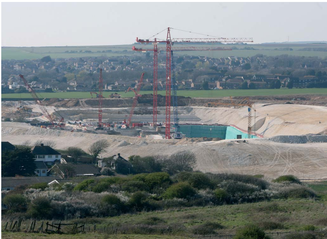
The site at Peacehaven

W ork has started on a £300 million environmental improvement scheme to bring cleaner seas to Sussex. When the new wastewater treatment works has been completed in 2013 it will be able to fully treat the 95 million litres of wastewater generated each day by over 250,000 people in the catchment area of Brighton and Hove. After treatment, the cleaned water will be recycled back to the environment 2.5 kilometres off-shore.