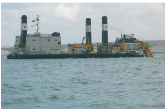
Dredging of sea bed for LSO