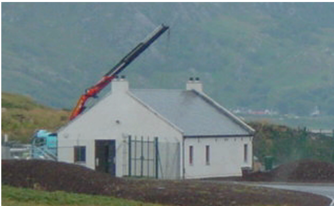
WwTW as a Crofter's cottage.

C romarty and Gairloch drainage schemes are both in areas of outstanding natural beauty. Gairloch in the Wester Ross Region of the Highlands, is duly recognised for the quality of its landscape and has been awarded National Scenic Area (NSA) status. Cromarty is an historic coastal village of significant archaeological importance which is also classified as a conservation area. The Cromarty Firth with its links into the Moray Firth is also a popular area for sightings of the Bottlenose Dolphin.