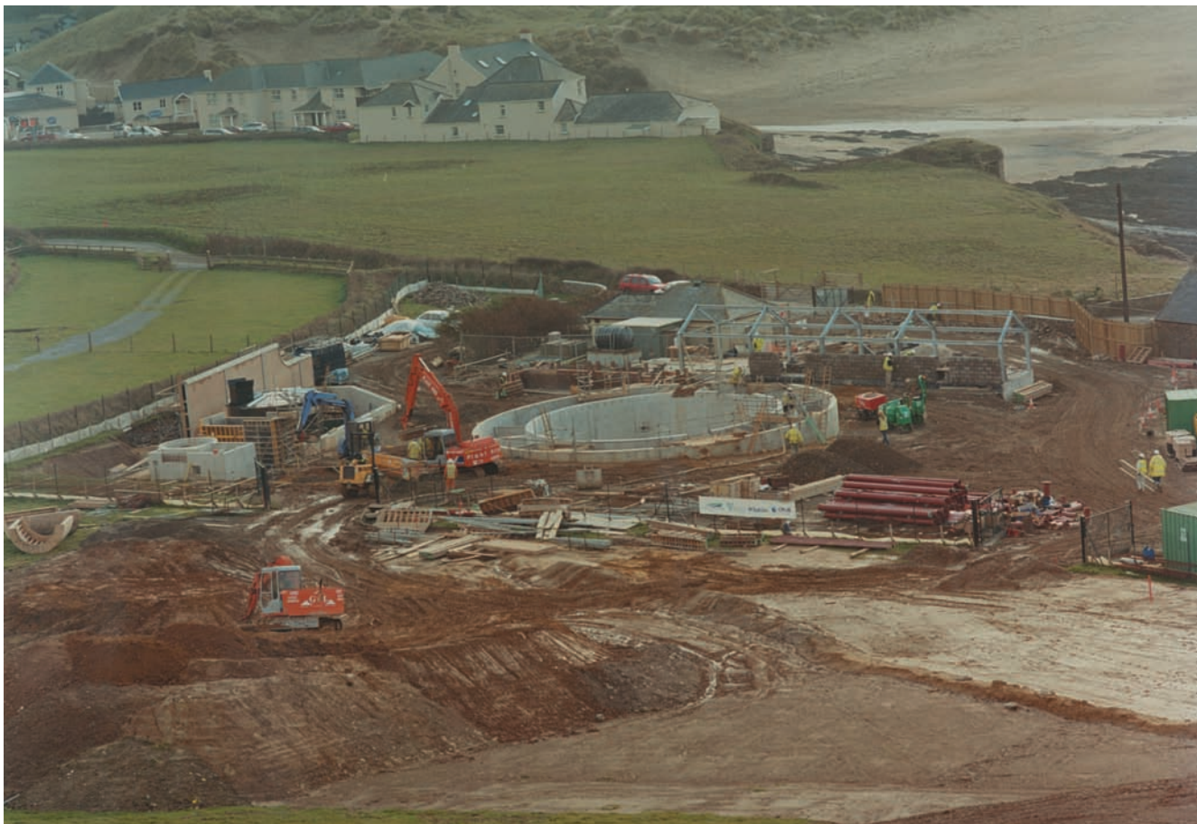
Croyde STW.

S outh West Water is required to provide sewage treatment at Croyde, a holiday resort situated in a beautiful area of North Devon, well known for surfing and many other seasonal coastal events including the ‘Gold Coast Ocean Feste’. Although the outfall is adjacent to a bathing water, the mandatory standard for bathing water compliance was already being met without the STW, but sewage treatment was required to meet the the Urban Wastewater Treatment Directive.