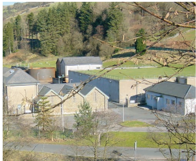
Pontsticill WTW - general view of new works (courtesy Welsh Water Alliance).

To fulfil the requirement of repairing all concrete damaged throughout the works and coating all surfaces proved to be extremely costly. First estimates were in the region of £8.5m to complete the work including replacing the filter floors and installing bypasses. Consideration was also given to demolishing