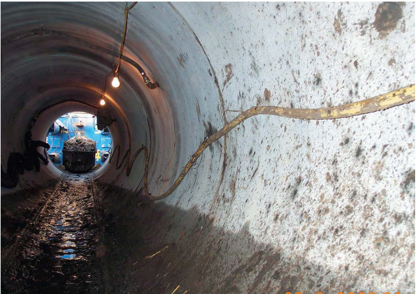
Hornsea: Sea outfall thrust bore

H ornsea, a seaside resort on the east coast of Yorkshire has a resident population of 8,500 which can rise to 25,000 PE during the most popular holiday weekends. At present, crude sewage from Hornsea is collected into a large pumping station situated on the town's foreshore, screened and discharged via a long sea outfall of plastic pipe construction which has been subject to flotation problems in the past. Storm flows are discharged into a short sea outfall. Crude sewage from the nearby coastal village of Mappleton is discharged to sea via a short sea outfall. As part of Yorkshire Water's 'Pride in Yorkshire's Coastline' programme, a scheme is underway to ensure Hornsea bathing waters comply with the Bathing Waters Directive and its waste water discharges comply with EC Urban Waste Water Treatment Directive. The project is the combination of two schemes.