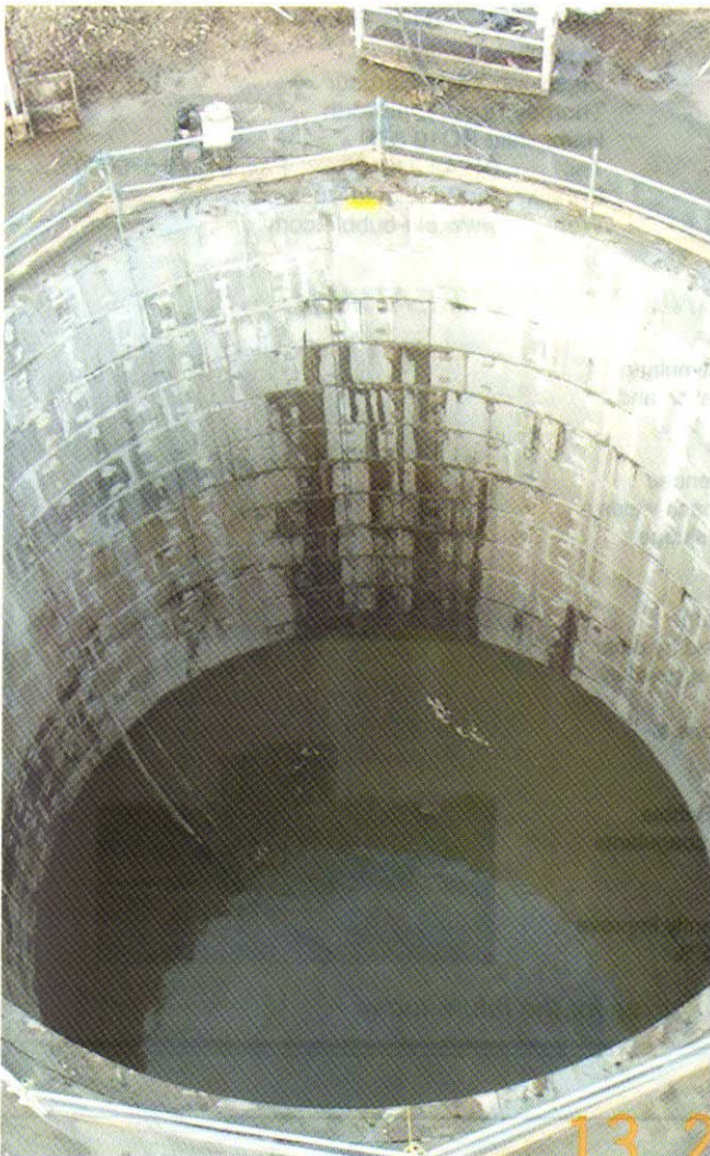
Hornsea: Sea outfall thrust bore

A selector zone and three 50% duty aeration lanes, each 20m x 4m