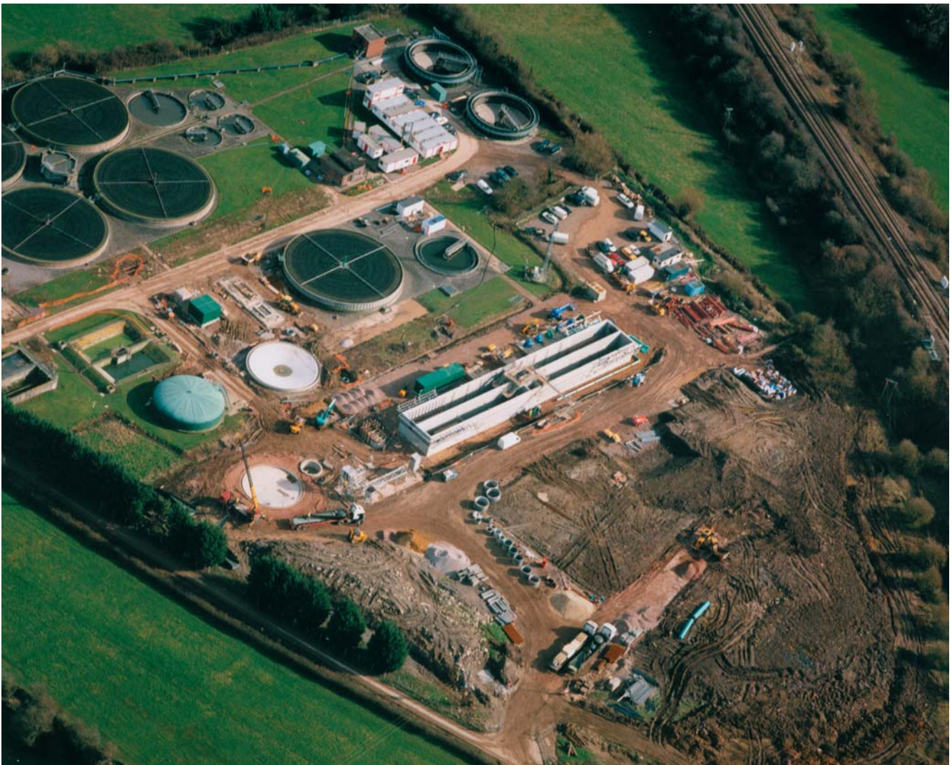
Aerial photo of Westbury STW (April 2002)

A n increase in demand for wastewater treatment capacity at Wessex Water's Westbury STW required the plant to be significantly extended and enhanced by a £6million multi-disciplinary project which will provide an entirely new treatment stream. The scheme is required to satisfy an increased demand placed on the existing works by a new milk processing plant and other industrial and residential waste producers. The new plant will also provide additional treatment for future effluent from a landfill site. At the same time Wessex Water has taken the opportunity to carry out a limited amount of asset renewal work on the existing biological filter process stream.