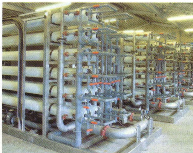
ACWa Filters, Hartlepool Water Seal Sands, Teesside

Each RO stream is controlled by its own control panel, driven by an Allen-Bradley PLC with local operator interface. Data highway links connect the RO stream control panels to an overall 'Supervisory' PLC. This starts and stops the system whilst also providing monitoring data for analysis by AWS and ACWa's specialist engineers. Routine monitoring of the plant allows effective preventative maintenance to be planned and implemented by ACWa's service engineers. This ongoing after sales service minimises operating costs and maximises membrane life and plant reliability.