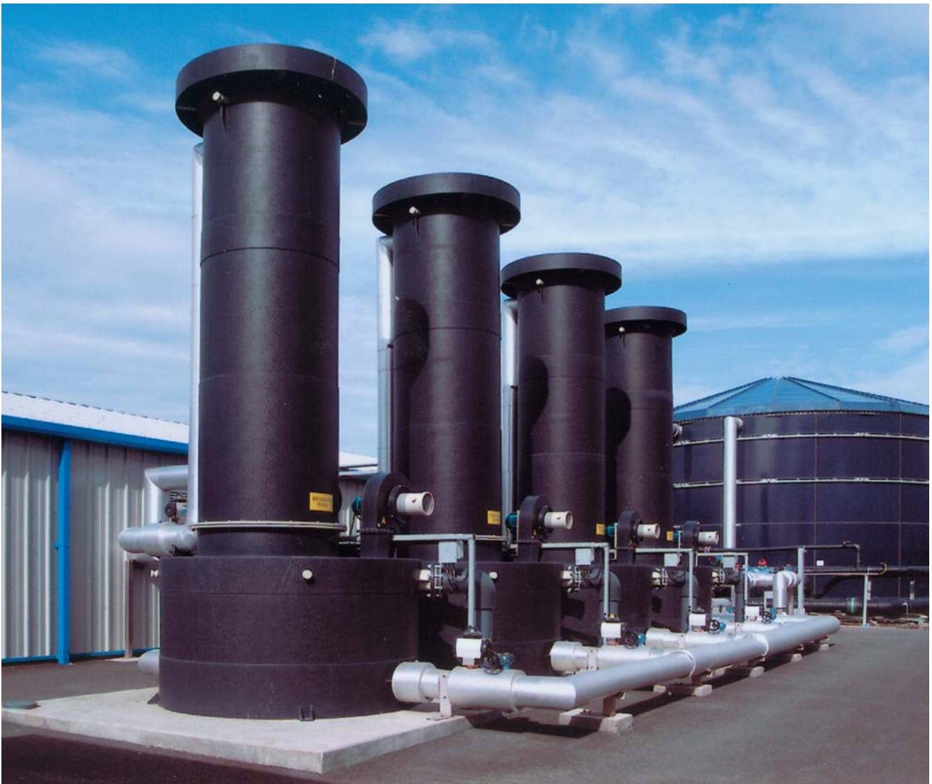
ACWa Filters, Hartlepool Water Seal Sands, Teesside

A high capacity water treatment system, which supplies industrial pure water has been provided for users within the Greatham and Seal Sands area of Teesside. The system comprises a fully automated and centralised high rejection (HR), reverse osmosis (RO) system, connected via a 12 kilometre ring main to supply Hartlepool Power Station and Huntsman site. RO permeate supplied to Huntsman's North Tees site is then demineralised in an additional water treatment facility using the latest mixed bed ion exchange technology. The system is linked with a nearby reverse osmosis system installed at Huntsman Tioxide plant.